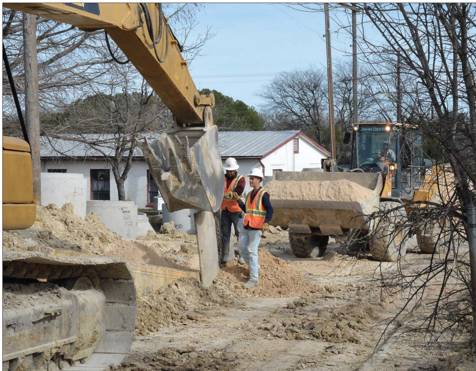
Construction continues on Twelfth Street, which has been closed since Sept. 19. The sewer line between Twelfth and Talbot is being replaced and re-routed because the line beneath the street collapsed after a heavy rain in March of last year. The break caused about 300,000 gallons of untreated water to dump into the Murphy Park Lake. The cost of the repairs is about $300,000.