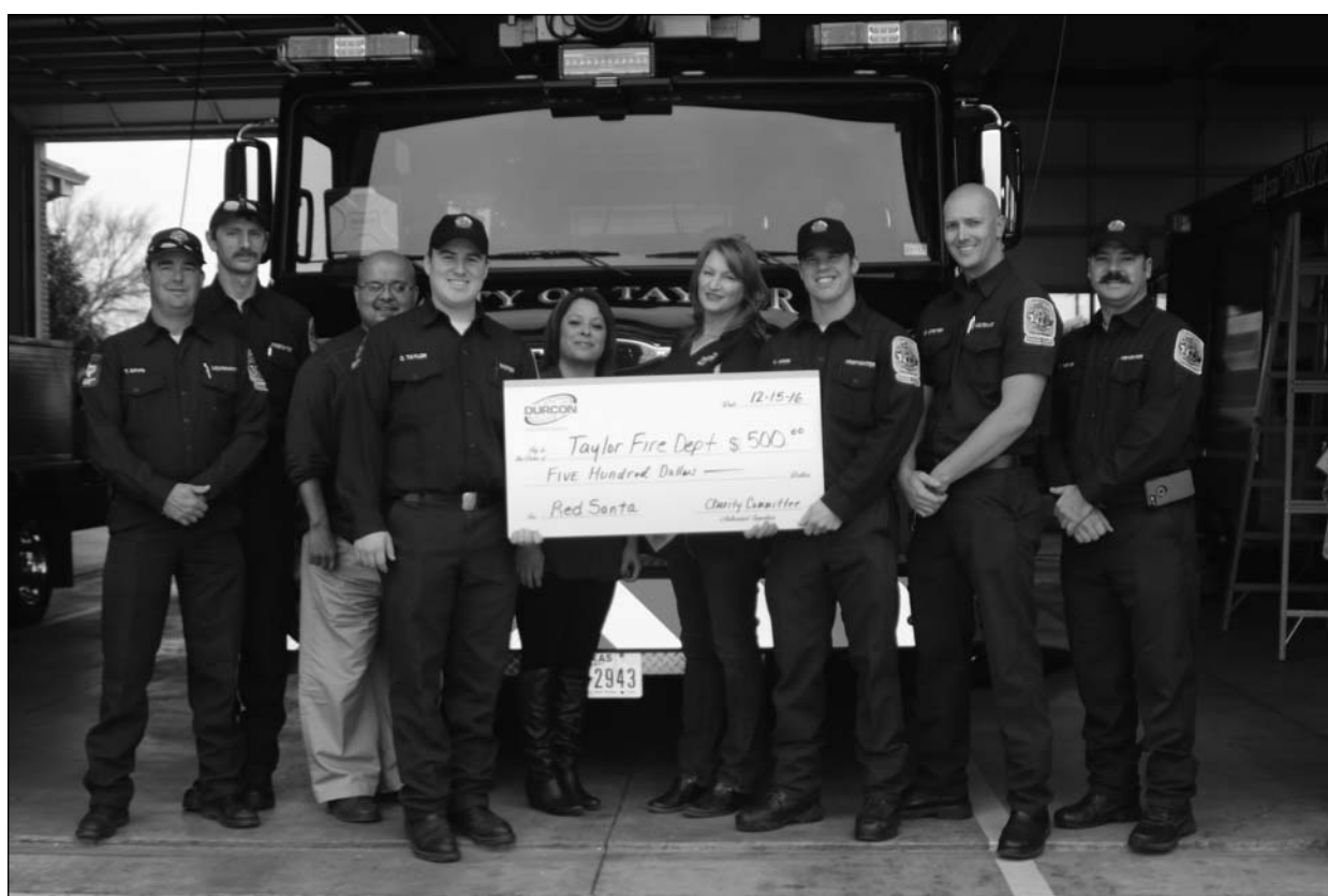
The Taylor Fire Department accepts a donation from Durcon for the Red Santa Program.